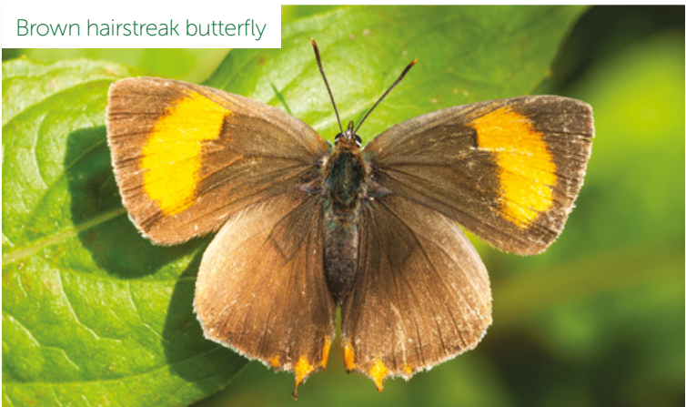
Brown hairstreak butterfly