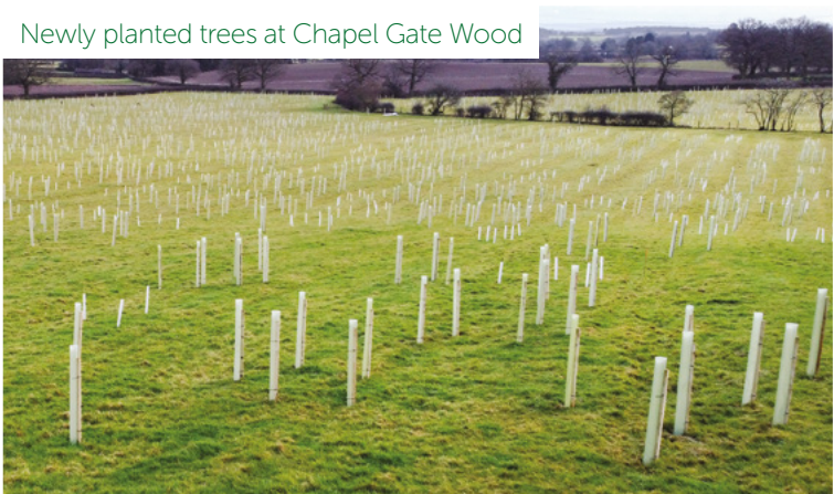
Newly planted trees at Chapel Gate Wood