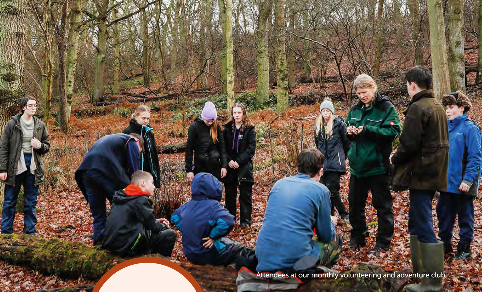
Attendees at our monthly volunteering and adventure club