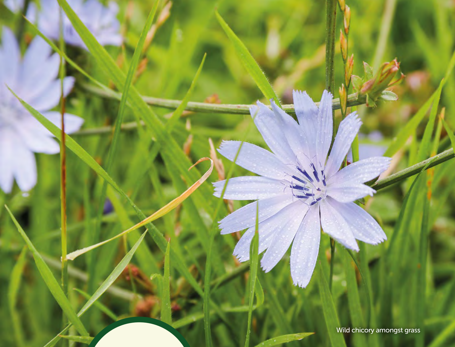
Wild chicory amongst grass