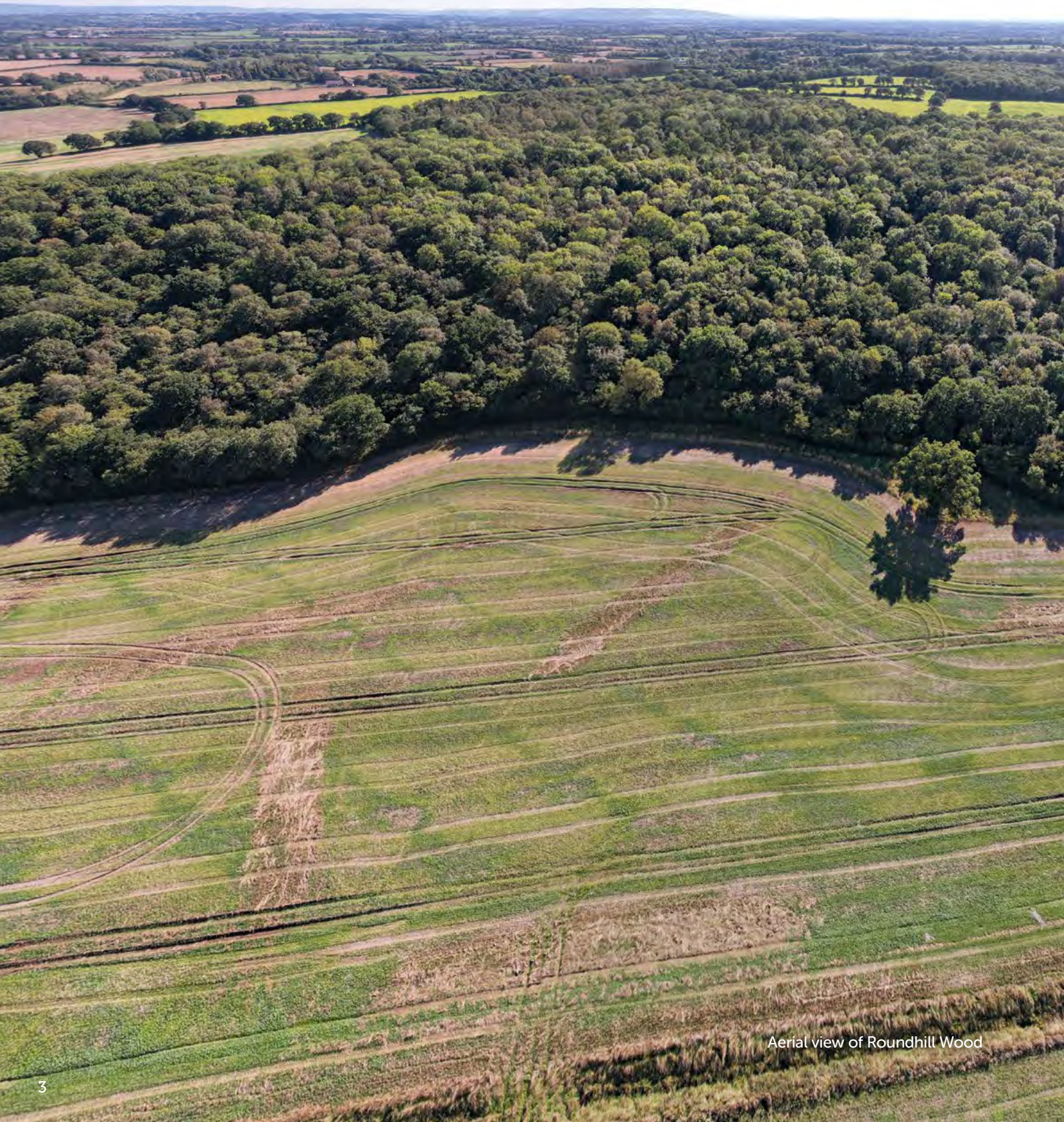
Aerial view of Roundhill Wood