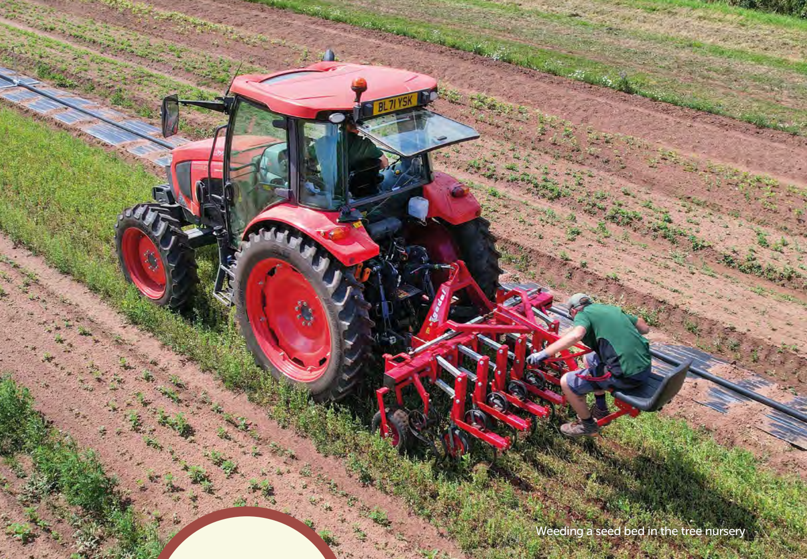
Weeding a seed bed in the tree nursery