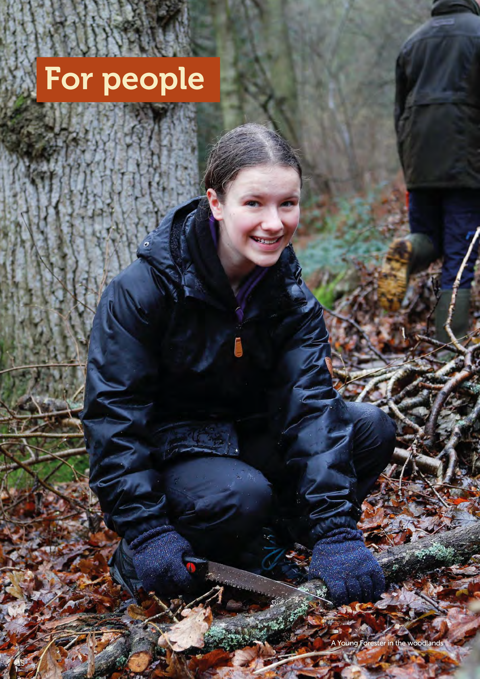
A Young Forester in the woodlands