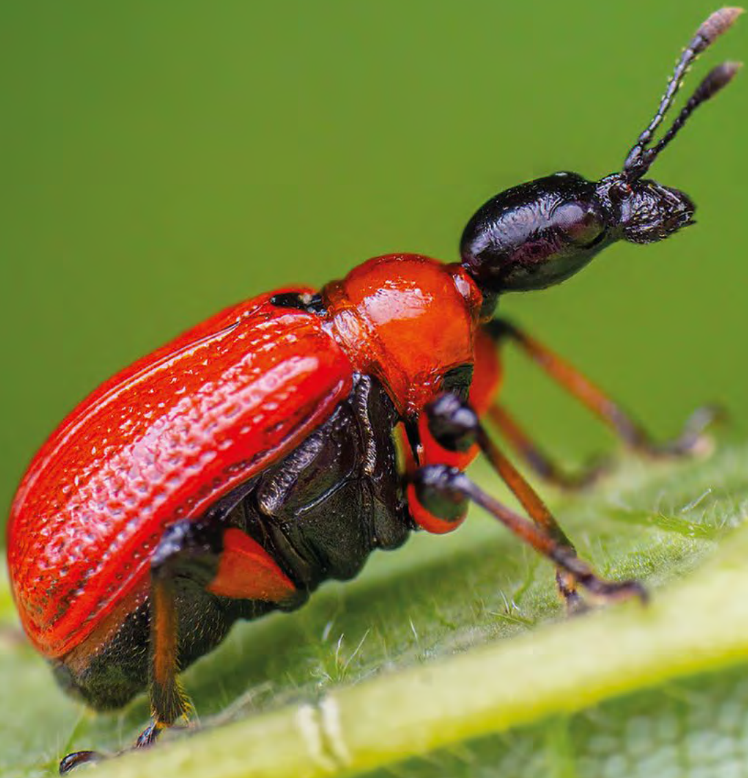
A macro photo of a hazel leaf-roller beetle in the Forest.